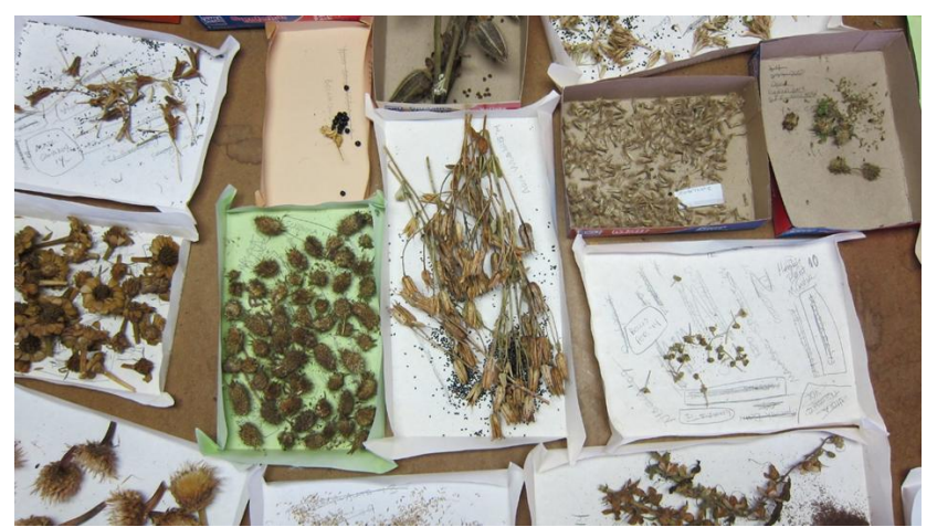
© Old Salem Museums & Gardens

You will find the presentation on Old Salem Museum and Gardens here: <u>Eight on-line session – European symposium on the conservation of historic fruit and kitchen gardens Colloque Européen sur la conservation des jardins fruitiers et potagers historiques</u>